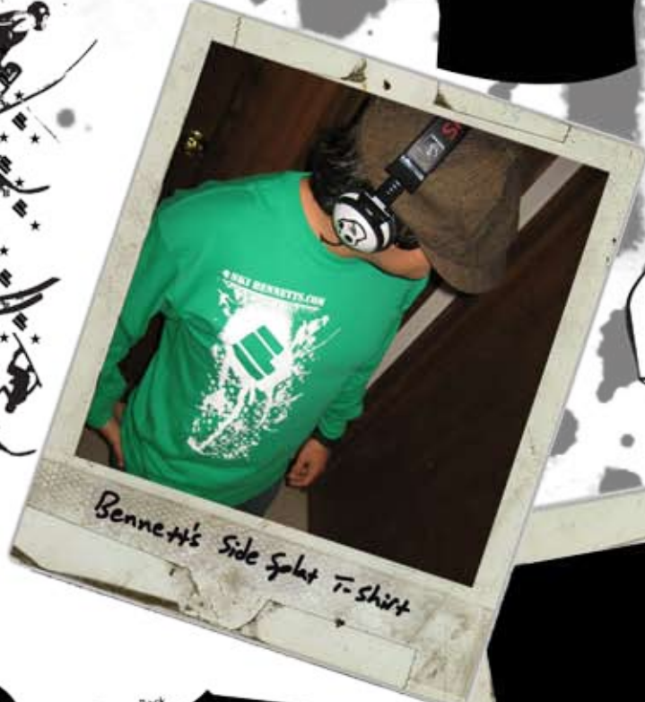
Bennett's Side Spat T-shirt