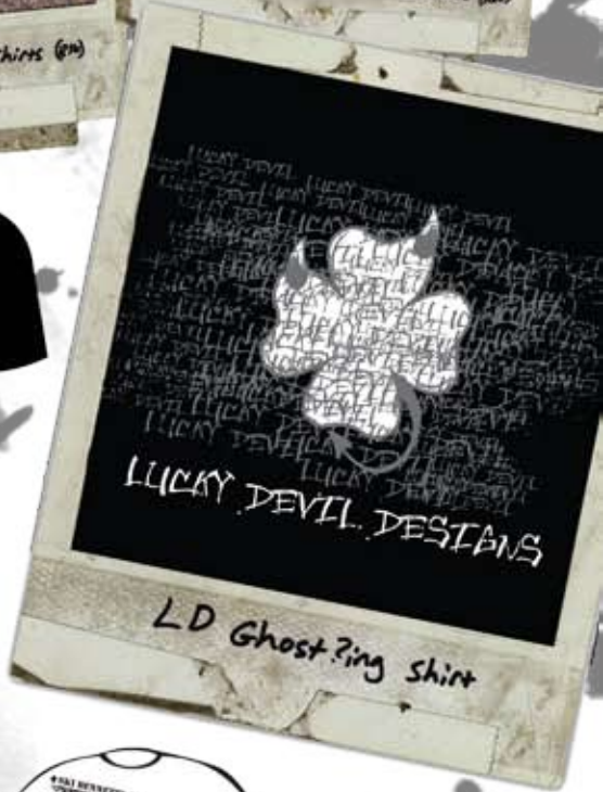
LD Ghost?ing shirt