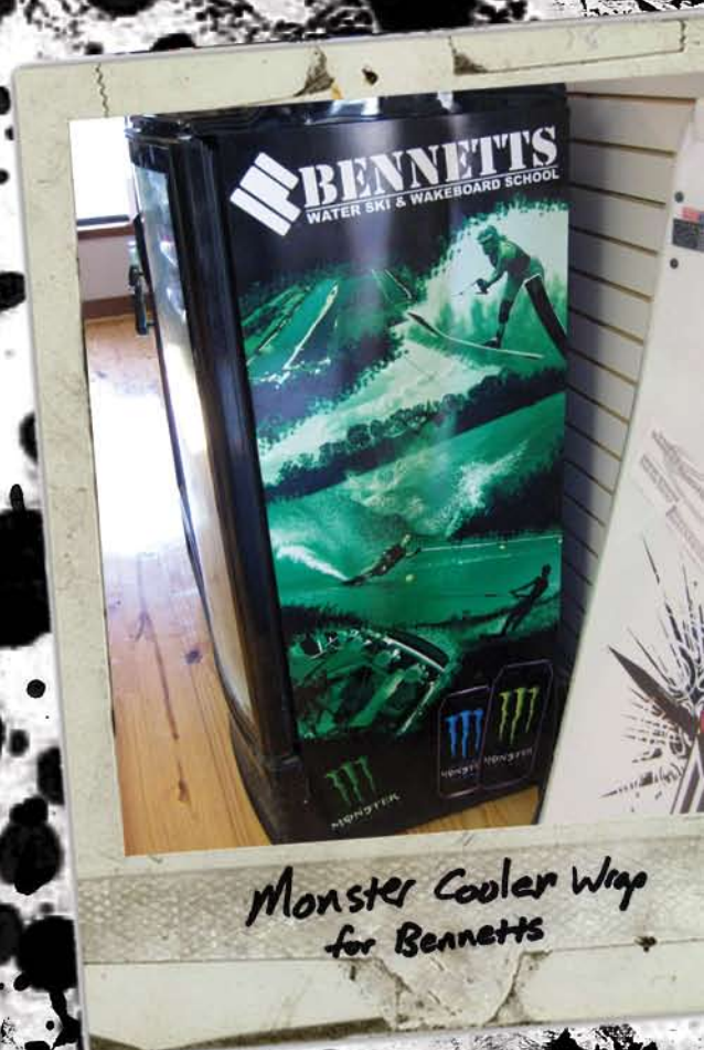
Monster Cooler Wrap for Bennett's