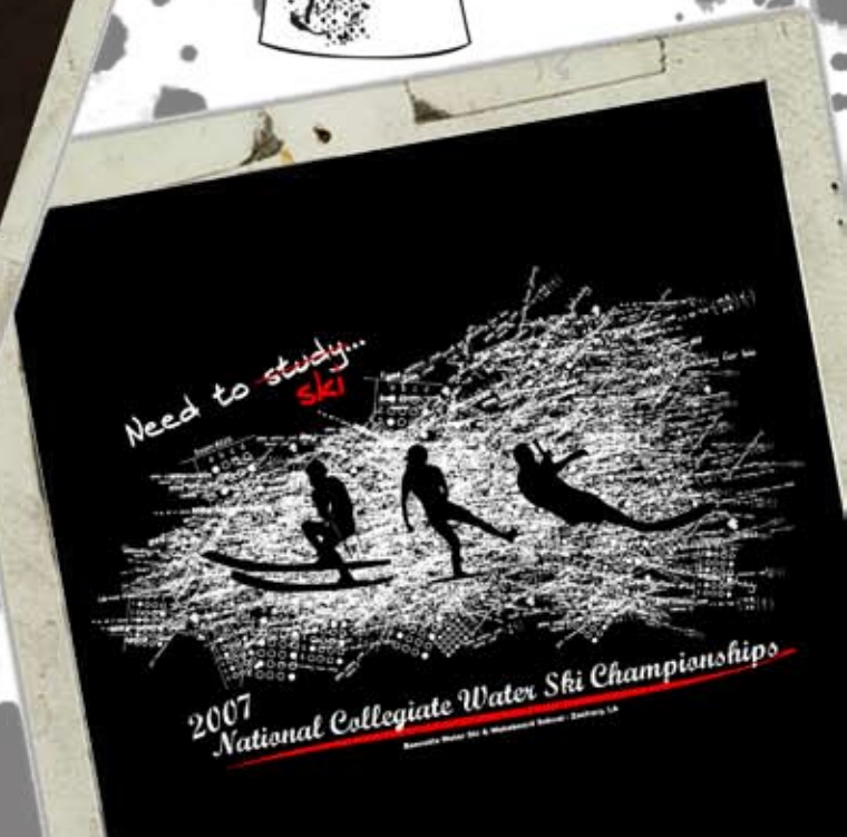
2007 National Collegiate Water Ski Championships