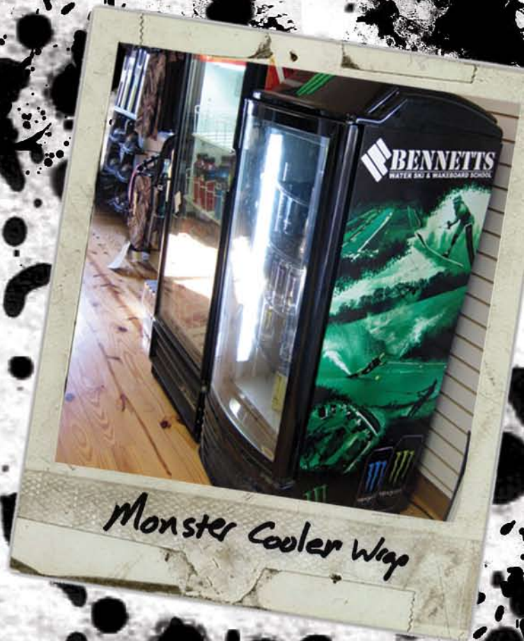
Monster Cooler Wrap